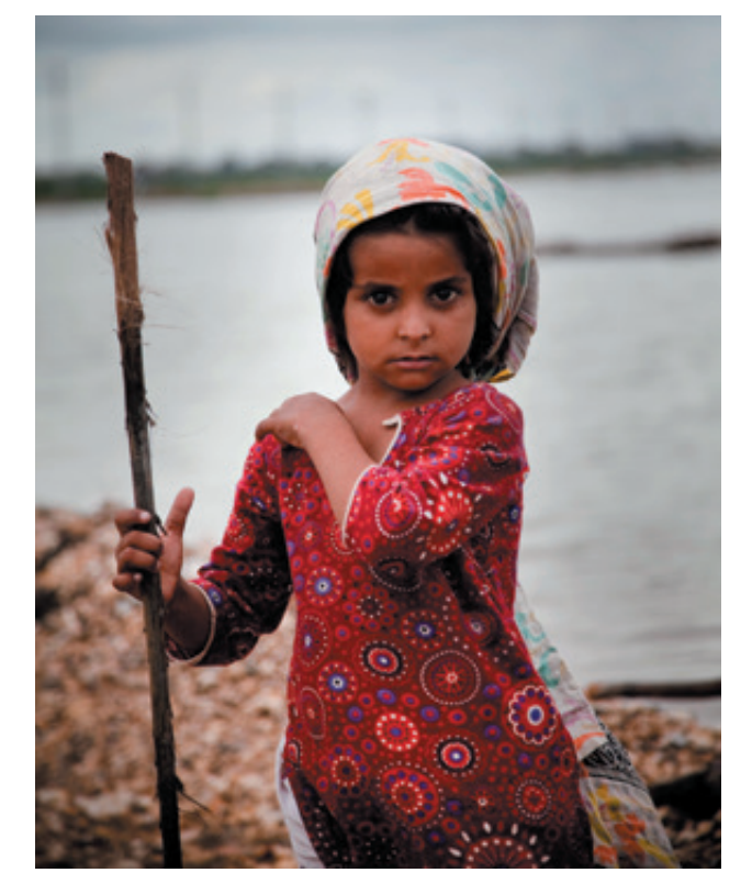
Pakistan, 2011. September 13<sup>th</sup>, a girl is in the camp of fortune of her community in the city of Hyderabad, in the province of Sindh. The community was moved because of the rise in the water level.

For land that remains above sea level: warding off the collateral effects of global warming by managing rivers and adopting irrigation programmes, better use of energy resources, developing