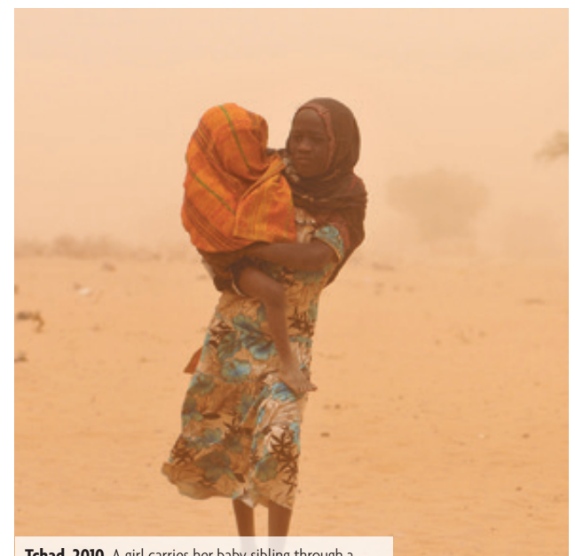
Tchad, 2010. A girl carries her baby sibling through a haze of dust in Sidi Village, in Kanem Region.