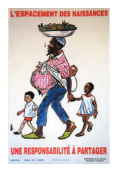
Poster of the Ministry of Health of the Republic of Guinea.

Women need to be recognised as actors in the fight against climate change. Despite the obstacles and the discriminations they suffer, women fight to reduce greenhouse gas emissions and to adapt to the impacts of climate change. They innovate on all continents by favouring conservation farming, which reduces water and fertilizer usage and fixes carbon. They set up reservoirs for irrigation and drinking water. They create entire waste recycling chains and pool their