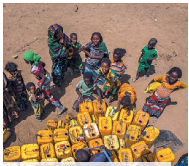
Bangladesh, 2014. On 9 February 2016 in central Ethiopia, children and women from a semi-pastoralist community wait their turn to fill jerrycans with clean water at a water point in Haro Huba Kebele in Fantale Woreda, in East Shoa Zone, Oromia Region.