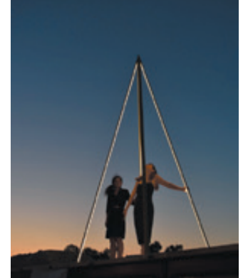
The audience igniting PYRAMIDION at its own pace, thanks to its connected cardiac sensor, 2018. "Milène Guermont/ADAGP.